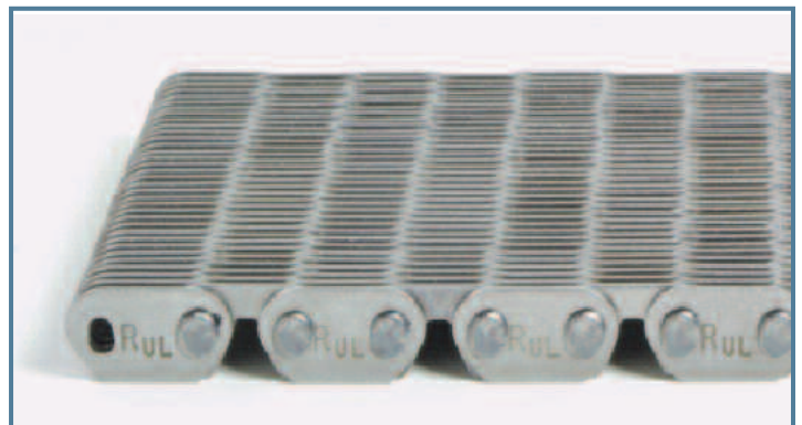
Single Pin Chain