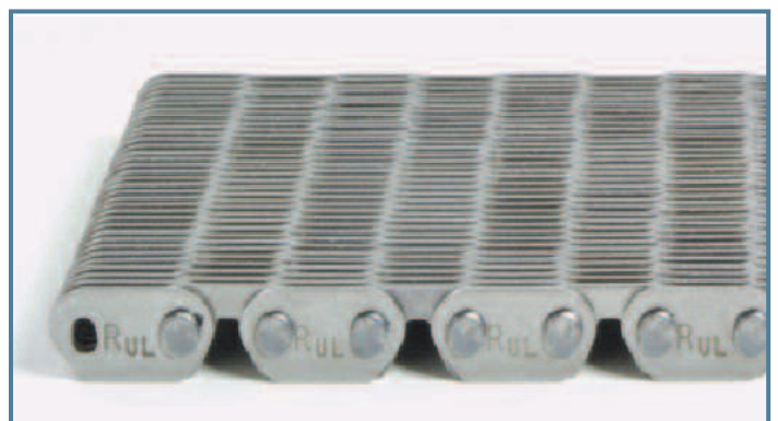
Single Pin Chain